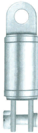
EYE AND JAW