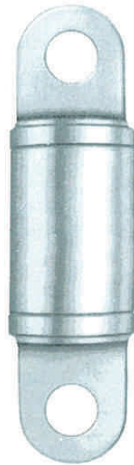
EYE AND EYE