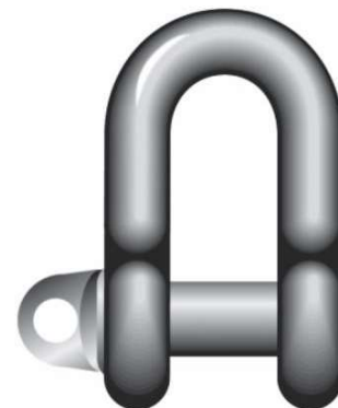
Large Dee Shackle

Due to our policy of continual product development, dimensions, weights and specifications may change without prior notice. Please check with your sales representative when ordering.